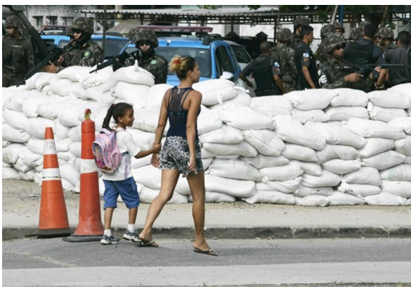
Military barricades in front of a day care center in the Vila Pinheiro during the occupation army to hold the World Cup in 2014 .

We need to develop educational projects in Maré that take into account not only the presence of the school as a physical space, for even this factor needs to be debated. How to Install new educational units on site if you do not take into account the territoriality dynamics of existing criminal groups in the region? In areas controlled by a rival criminal group, students from another area cannot have access.